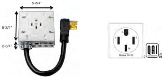
Overall length cord included – 22-3/4"